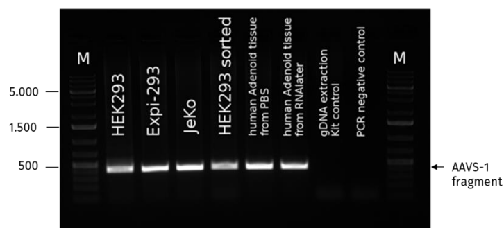
Figure 2. Agarose Gel Electrophoresis of DNA after nested PCR on gDNA extract from different human cell samples. M: DNA ladder GeneRuler 1kb Plus .

In order to study DNA quality when working with a low amount of cells, we prepared a cell number series