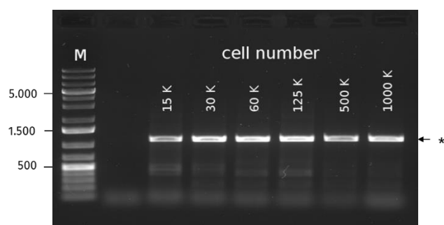
Figure 4. Agarose Gel Electrophoresis of DNA after PCR on gDNA extracted from different numbers of HEK293 cells. Lane 1, no-template amplification control; M: DNA ladder GeneRuler 1kb Plus; * 1099 bp PCR fragment from AAVS genomic locus.

sample. Results are shown in Figure 4. The reduced absorption ratio had no effect on PCR amplification.